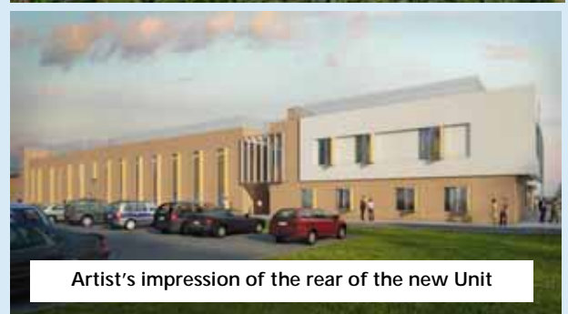
Artist's impression of the rear of the new Unit