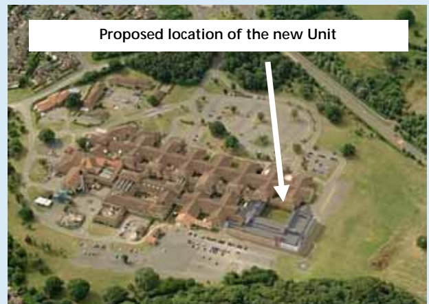
Proposed location of the new Unit