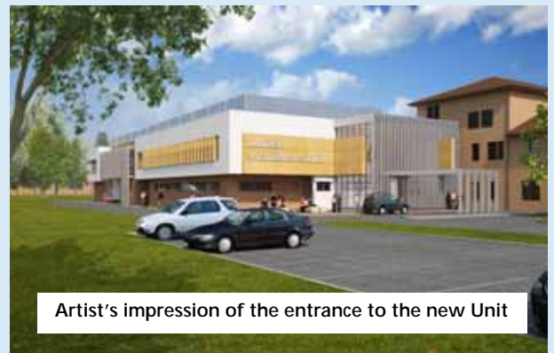
Artist's impression of the entrance to the new Unit

We are looking forward to meeting again soon when we will be asking for members' views on the furniture, colour schemes and "look and feel" of the new unit. If you are interested in taking part then please email future@sath.nhs.uk or call 01743 261275.