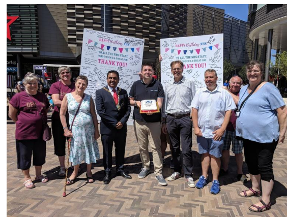
Happy Birthday NHS, Southwater, Telford & Wrekin

International Children's Day Festival organised by the Shrewsbury Polish Centre