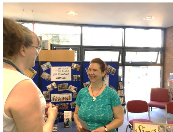
Health Information Day, Ludlow Library

Proud To C Make It Happen We Value Respect Together We Achieve