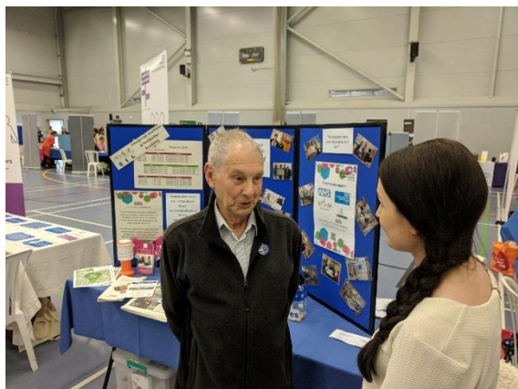
See Hear Shropshire

We are going out into our communities to engage with the public across Shropshire, Telford & Wrekin and Powys.