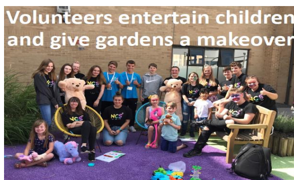
Volunteers entertain children and give gardens a makeover

Two groups worked on different projects; one team raised funds to buy plants which were used after clearing some green space around the Trust. Another group borrowed one of the charities tombola drums and raised money to purchase toys for the children's ward.