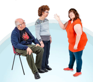
You can form a support bubble with friends or family