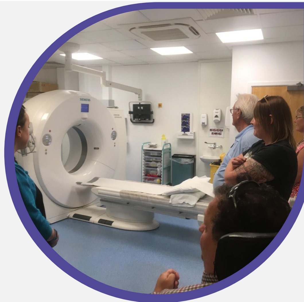
A People's Academy prior to the pandemic

Please register for our People's Academy online at: https://sathnhs.eventbrite.co.uk/