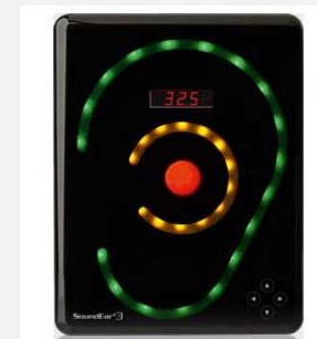
SoundEar Microphone and Software - £1,148