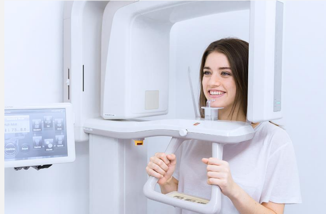
Cone Beam Machine part funded by SATH Charity - £7,277