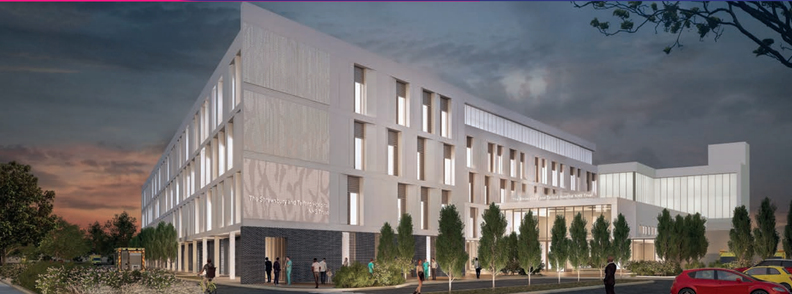
Computer generated image of the new facilities at the Royal Shrewsbury Hospital site

A community update on works at Royal Shrewsbury Hospital including the Hospitals Transformation Programme