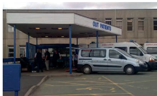
Royal Shrewsbury Hospital

We are progressing through the final stage of national approval for the HTP development. We have received planning permission for the works at Royal Shrewsbury Hospital.