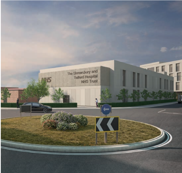
Computer generated image of the new modular building which will house a new rehabilitation and recovery unit

We are proposing to construct a new two-storey building that will create much-needed additional wards. These will support patients with rehabilitation and recovery, increase our resilience during extreme pressures and also reduce delays and waiting times in our Emergency Department.