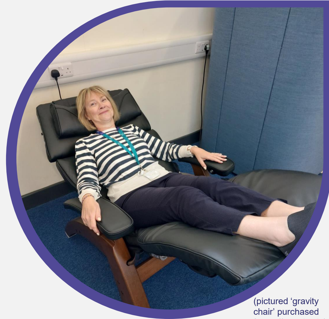
(pictured 'gravity chair' purchased for staff to relax in)