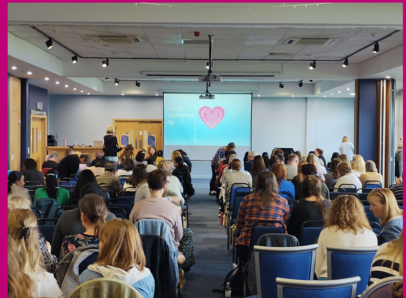
Diabetes Conference sponsored by SaTH Charity