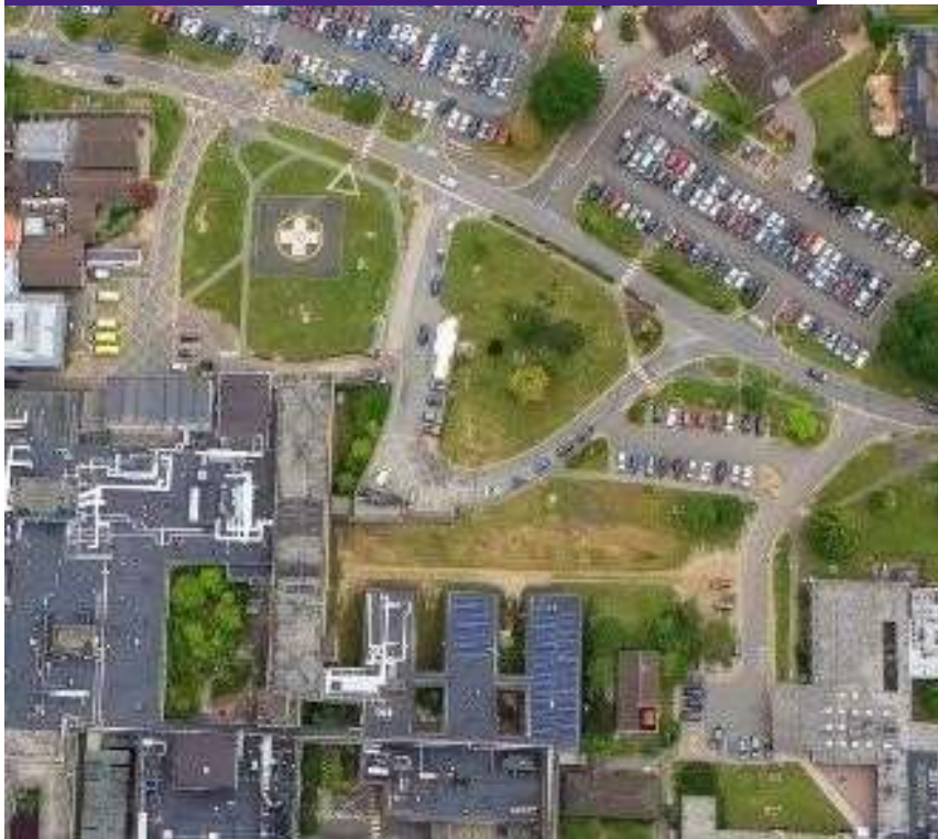
RSH site before work commenced: