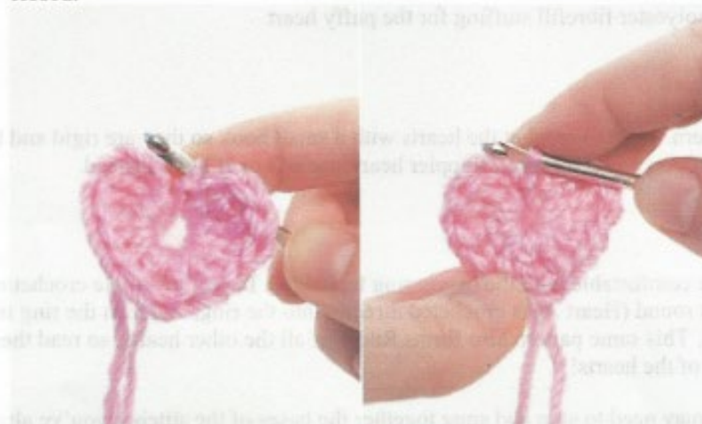
Left: Final sl st made. Right: Magic ring pulled tightly closed.