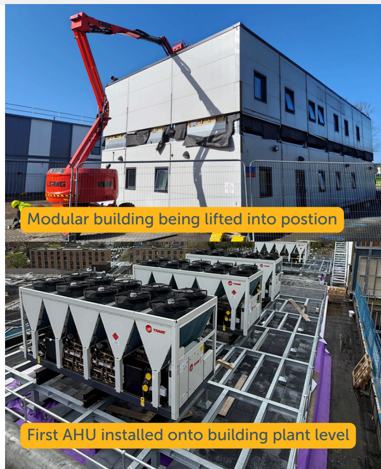
Modular building being lifted into position